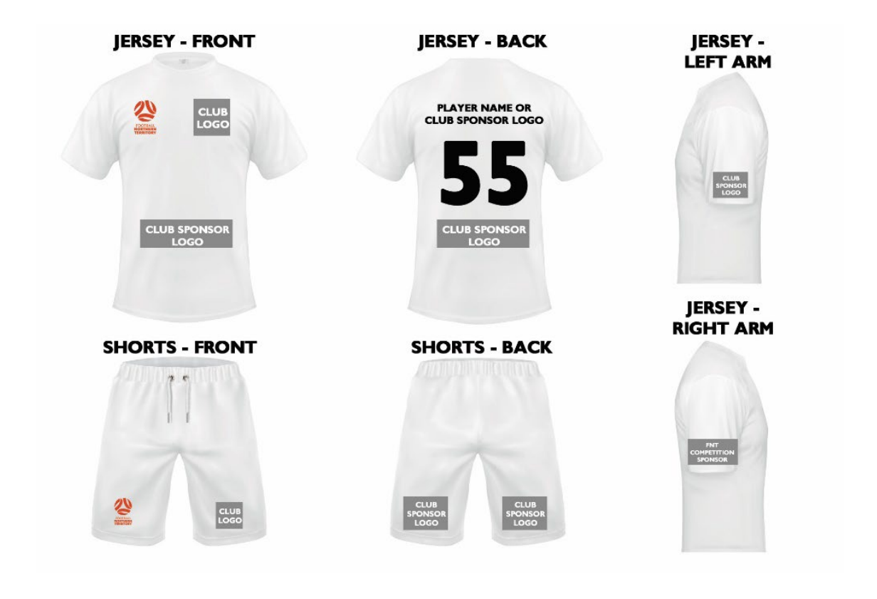
Figure: Football NT Senior competitions playing strips style guide